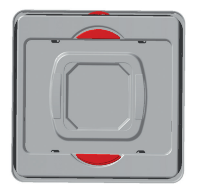
Vento with emergency exit