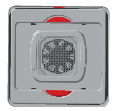
Vento with fan with emergency exit