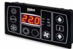
Functional, robust and easy to operate