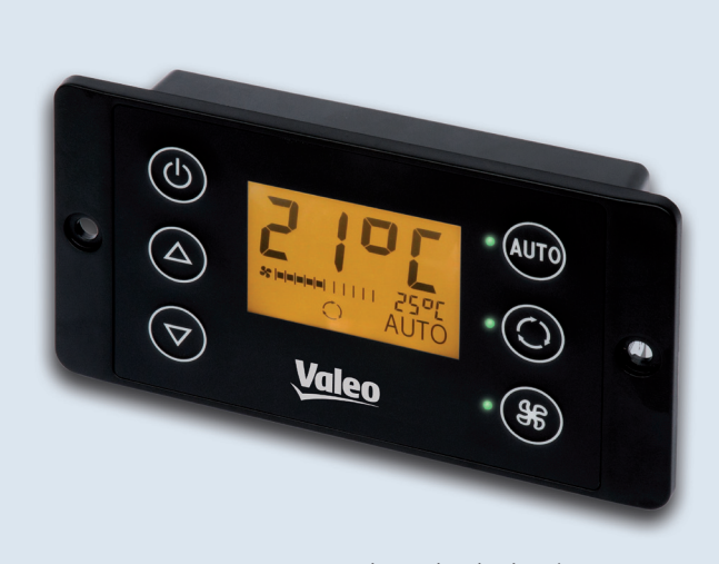
Control unit and display, the central unit in the modular Valeo Body Interface Concept.

SC 600 – Integrated control at the driver's seat, deployable worldwide.