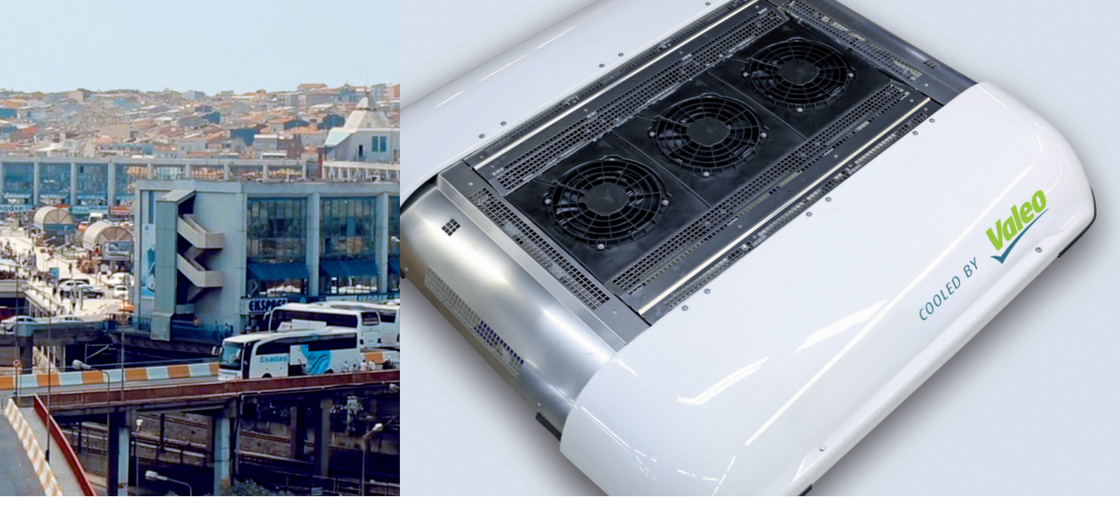
Designed for all types and demands of buses and coaches from 22 to 47 kW.