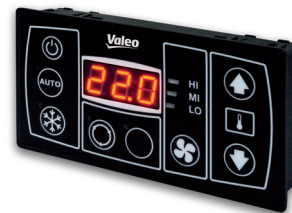
Functional, robust and easy to operate