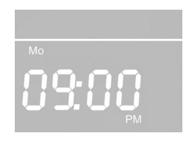
Figure 5 - SC Preheater e.g. Standard display 12h mode