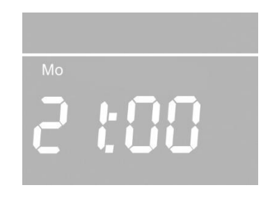
Figure 4 - SC Preheater e.g. Standard display 24h mode