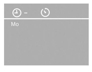
Figure 3 - SC Preheater e.g. menu row