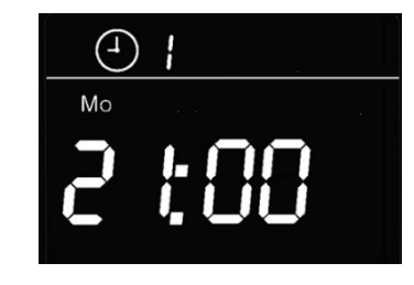
Figure 6 - SC Preheater starting time activated